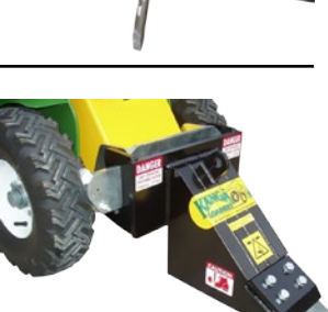
VINYL STRIPPER 0K50220 Quickest way to remove floor coverings including vinyl, carpet, wooden floor and even scraping the adhesive used.

Rock Breaker ideal for breaking up pavement, sidewalks, driveways. Ideal for internal and external demolition. Must be used with Hydraulic oil cooler for extended periods of use. Eliminates Hand Arm Vibration (H.A.V.)