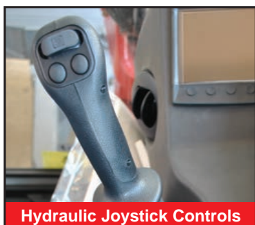
Hydraulic Joystick Controls