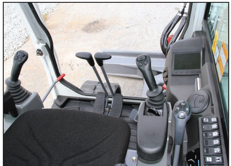
Automotive Styled Interior