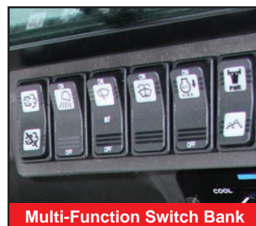
Multi-Function Switch Bank