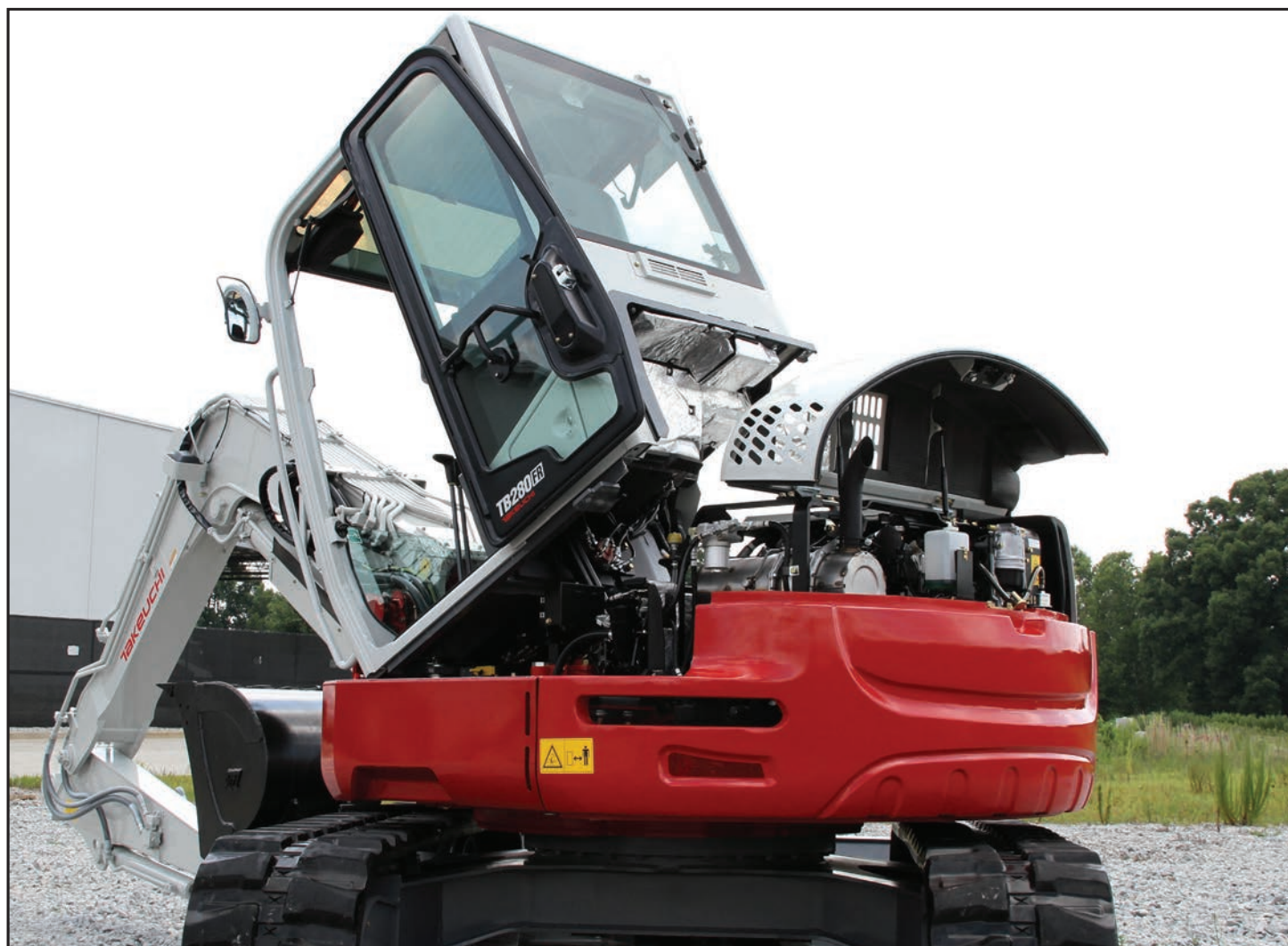
A tilt-able cabin and large lockable service hoods provide outstanding maintenance access.

as a smaller 5 ton machine for greater performance and productivity. Additional features include an updated cabin with automotive styled interior, color multi-informational display, multiple attachment presets with operator adjustable flow rates, standard auxiliary hydraulic circuits 1 & 2 allowing the operator to run a wide range of attachments, backfill blade and a tilt-up cab for greater serviceability.