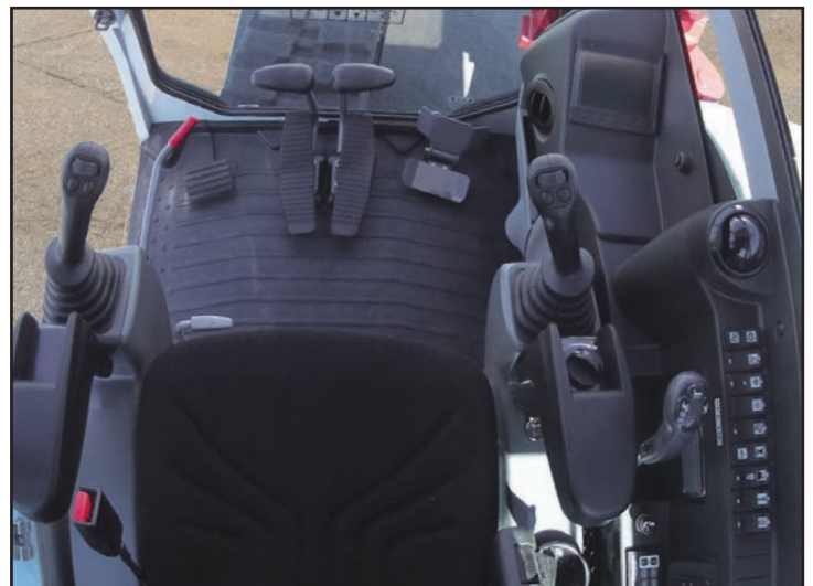
Automotive Styled Interior