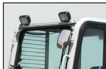
Optional Work Lights

The TB280FR is a unique platform that separates itself from the competition with its unique side-to-side (STS) boom configuration and full rotation (FR) capabilities. One of the greatest benefits of the STS boom is the unmatched visibility to the attachment and job site. This design also allows the boom to be stowed over center in the full upright position enabling it to make a full rotation (FR) within a very tight radius allowing it to work within similar confines