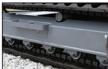
Triple Flanged Track Rollers