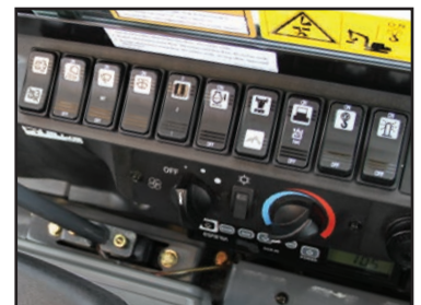
Multi-Function Switch Bank