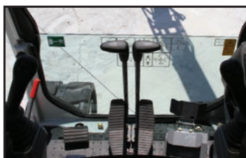
Large Floor with Foot Rest